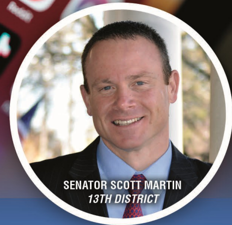
SENATOR SCOTT MARTIN 13TH DISTRICT